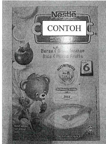
FIGURE Q3 (a)

: PAPER AND PAPERBOARDS PACKAGING COURSE CODE : BNK 30303