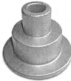
Figure Q1 (b)