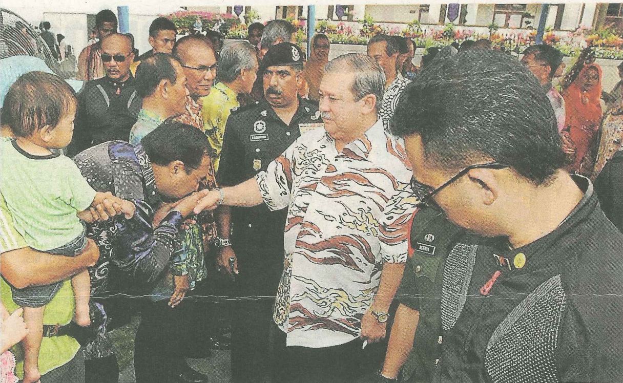
Sultan Ibrahim Sultan Iskandar meeting the people during the high tea event held in conjunction with his birthday celebrations.