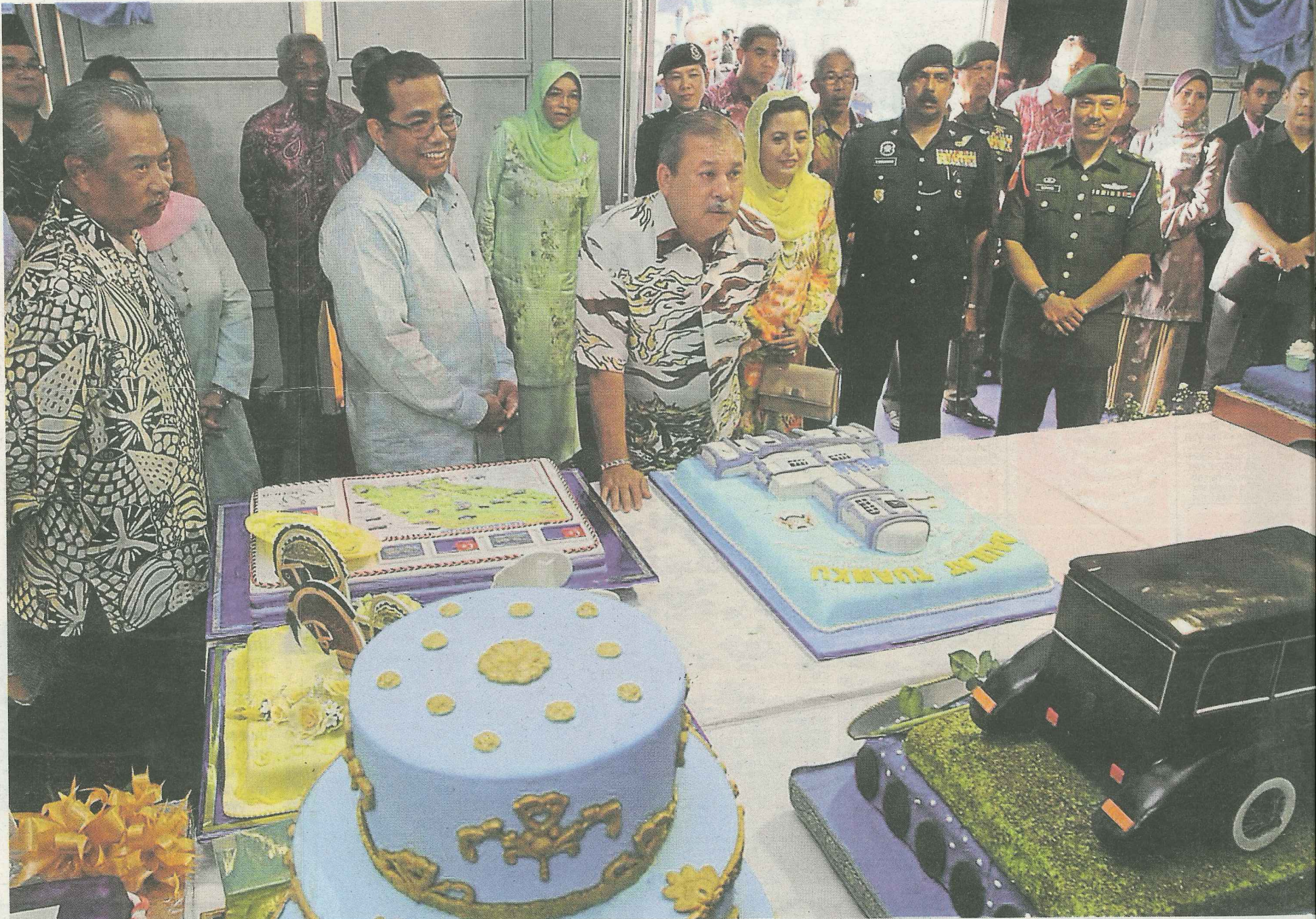
Cake out: The Ruler (third from left) admiring the birthday cakes on display during the event. Also present were Raja Zarith (right behind Sultan), Muhyiddin (far left) and Khaled (second from left).

Other events in this year's celebrations included an investiture ceremony held at Dewan Jubli Intan Sultan Ibrahim, a tea party that was attended by thousands, and officiat-