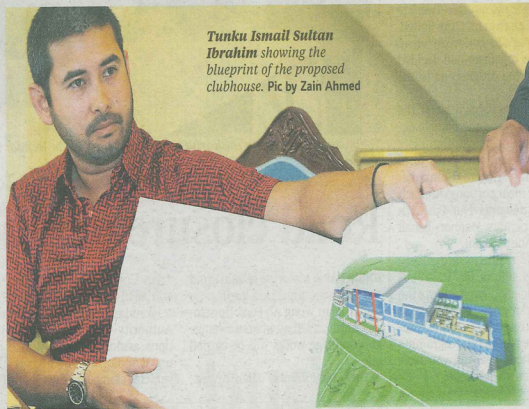
Tunku Ismail Sultan Ibrahim showing the blueprint of the proposed clubhouse.