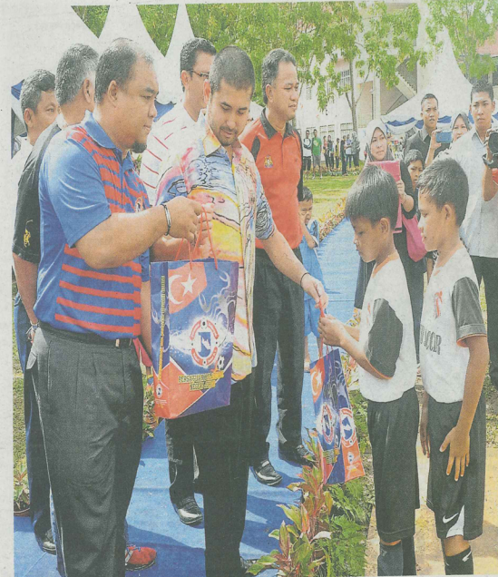
Tunku Mahkota Johor Tunku Ismail Sultan Ibrahim is building a football academy that will use Johan Cruyff's modules to mould talented youngsters into professional players of calibre.