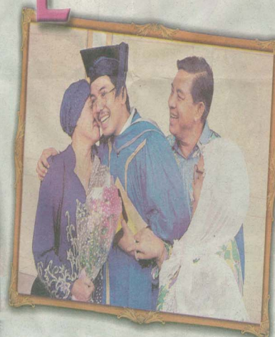
UUM produces successful graduates in various fields.