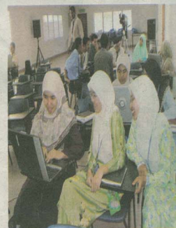
Competency in technical knowledge and soft skills is the hallmark of KUKTEM graduates.