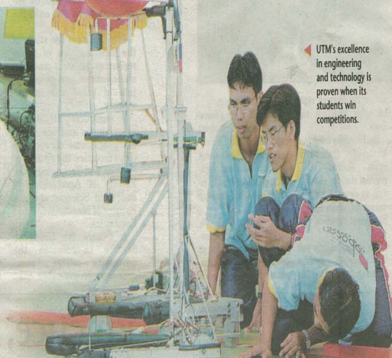
UTM's excellence in engineering and technology is proven when its students win competitions.