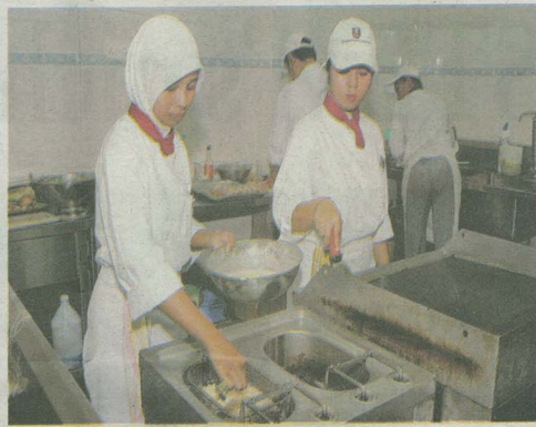
UTM looks to operate within certain government policies while anticipating new trends.