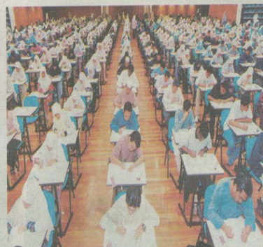
Graduates from IUM are admired for their language skills.