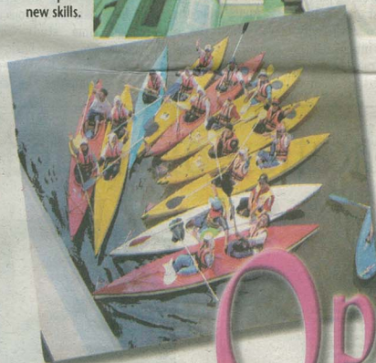
KUSTEM students often go on excursions to understand their courses better.