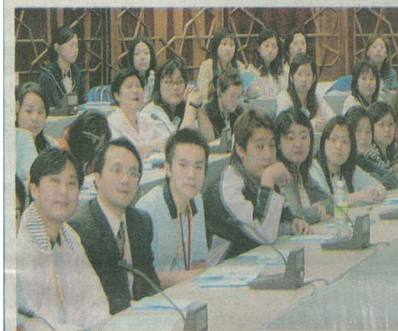
To enhance students' knowledge, UKM often invites visitors to the university.