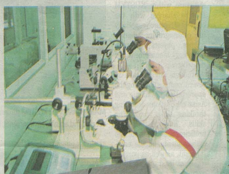
Impressive facilities at KUKUM help students acquire new skills.