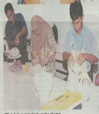
UPSI students are trained to be creative educators.