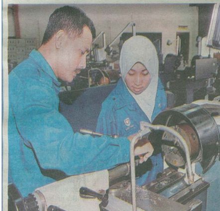
KUITTHO emphasises on experiential and guided learning instead of just tutorials and lectures.