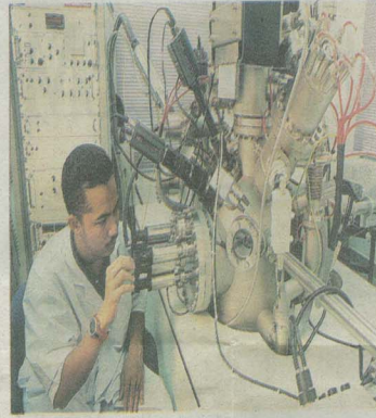
UM is well known for its science and technology courses.