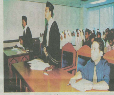
KUIM graduates are trained to function effectively.