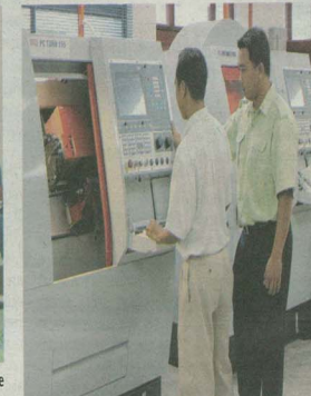
UNIMAS' student profile shows a person who is highly knowledgeable in his own field and one or more other fields.