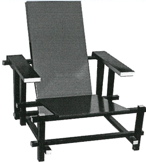
Figure Q1(b): De Stijl Red and Blue Chair